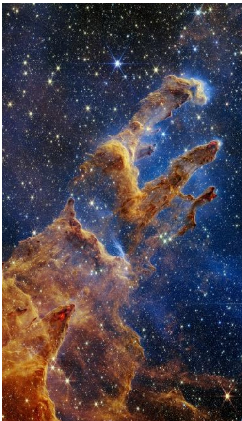
Pictured: The Webb telescope's breath-taking view of the Pillars of Creation.

Nasa's James Webb Space Telescope has taken a star-filled snap of the Pillars of Creation. This is the sharpest image ever captured of the iconic area of intense star formation, and was made possible by using the space telescope's near-infrared camera. The Pillars of Creation are in the Serpens constellation, in the Eagle Nebula, which is around 7,000 light-years from Earth. A light-year, a large unit of length used to express astronomical distances, is the distance a beam of light travels in one year. In interstellar space, light travels at approximately 300,000 kilometres per second, or 9.46 trillion kilometres per year. Nasa says, 'the ethereal scene captures translucent columns of cool interstellar gas and dust punctuated by piercing, bright points of light. Most of these are stars, and the reddish balls of fire near the edges of the pillars are newly formed stars.'