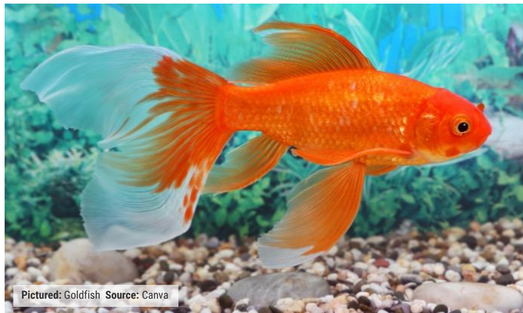
Pictured: Goldfish