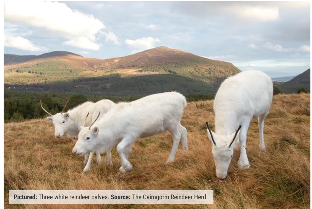
Pictured: Three white reindeer calves.