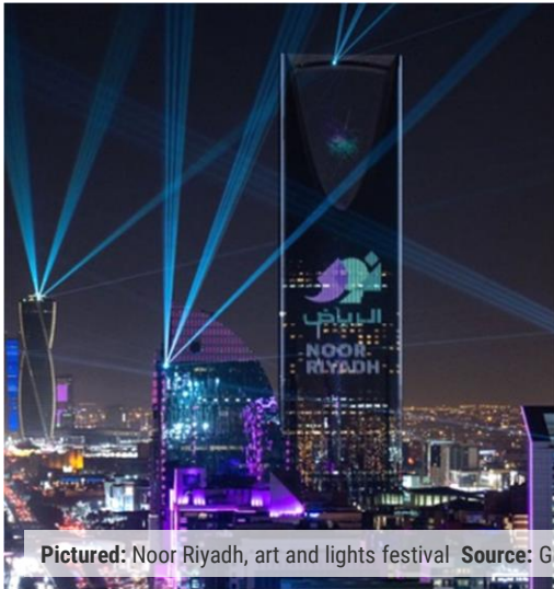
Pictured: Noor Riyadh, art and lights festival