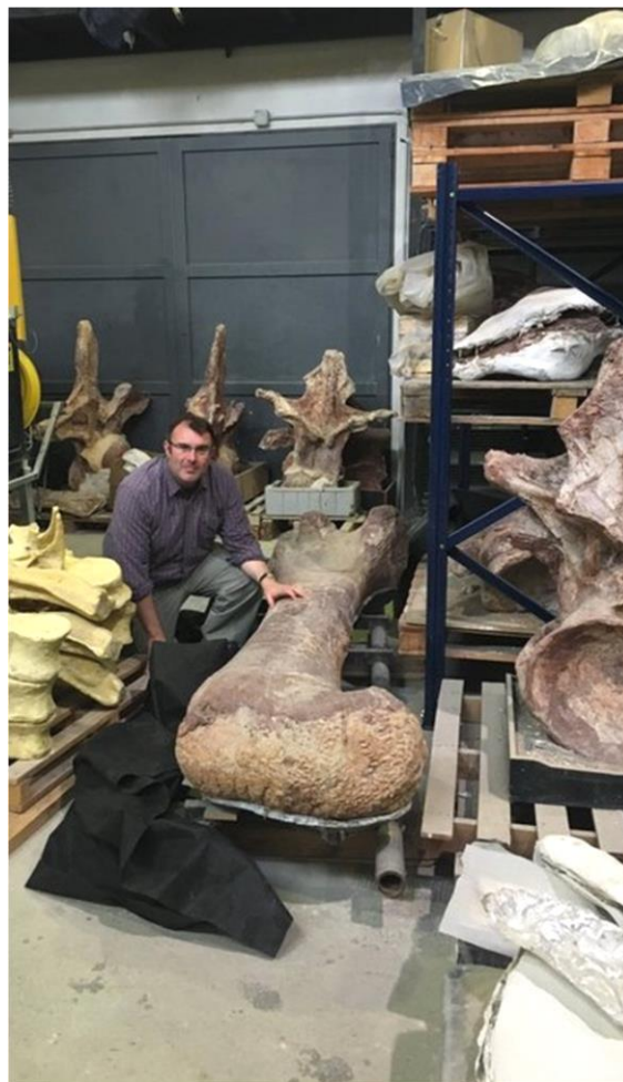
Pictured: Professor Paul Barrett showing the scale of Patagotitan

The Natural History Museum, in London, is getting a new dinosaur to display and it's the biggest so far! The colossal titanosaur Patagotitan mayorum, the largest known creature to have ever walked our planet, is going on display for the first time ever in Europe. The cast of Patagotitan mayorum is being loaned to the museum by the Museo Paleontologico Egidio Feruglio in Argentina, which excavated the giant skeleton in 2014. The giant prehistoric creature is much bigger than the museum's other exhibits, weighing 57 tonnes (four times heavier than Dippy the Diplodocus) and measuring 37 metres (12m longer than Hope the blue whale). Professor Paul Barrett, science lead for the exhibition, said, 'Patagotitan mayorum is an incredible specimen that tells us more about giant titanosaurs than ever before. Comparable in weight to more than nine African elephants, this star specimen will inspire visitors to care for some of the planet's largest and most vulnerable creatures, which face similar challenges for survival, and show that within Earth's ecosystems, size really does matter.'