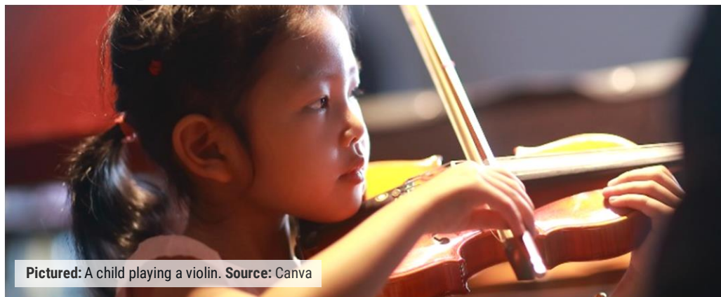
Pictured: A child playing a violin.

The Acoustical Society of America is 3D-printing violins to make the instrument more affordable for hundreds of children and adults who want to learn how to play. The 3D-printed violins are created in two sections, with the violin's body being made from a plastic polymer material. The neck and fingerboard are printed in smooth ABS plastic, which clips on to the body and gives a comfortable grip for musicians. The violins are much cheaper than a traditional violin, which can cost over £600. The 3D-printed violin cost only