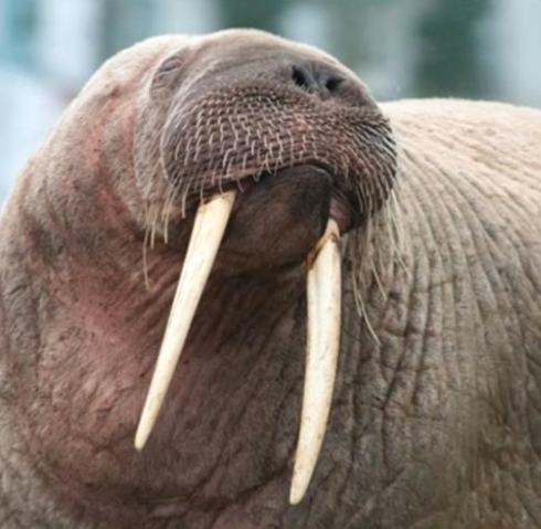
Pictured: Thor the Walrus in Scarborough