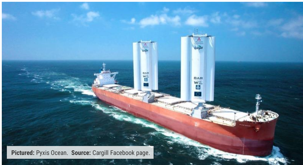
Pictured: Pyxis Ocean.

What do you think of using this technology to help reduce the shipping industry's emissions?