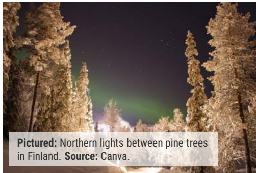
Pictured: Northern lights between pine trees in Finland.

Do you think this is a good way to work out how happy nations are?