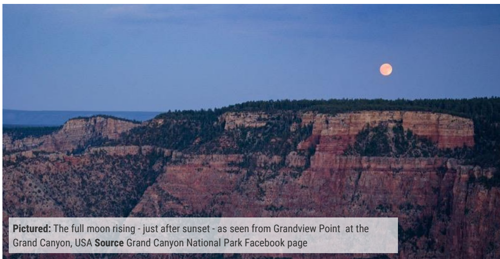
Pictured: The full moon rising - just after sunset - as seen from Grandview Point at the Grand Canyon, USA

An amazing supermoon has appeared in our skies for three days. A supermoon is when the Moon appears to be much larger than usual because it is closer to our planet. This happens as the Moon's orbit is not a perfect circle due to the Earth's gravitational pull, it is an oval shape. The Moon is less than 365,000 kilometres from Earth, which is around 22,000km closer than normal. The first full moon after Summer Solstice (the longest day, 21 st