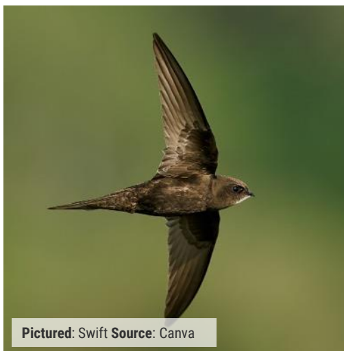
Pictured: Swift

10,000 bricks with built-in bird houses have been installed into UK homes to create nest holes for swifts. Swift bricks are normal building bricks with a hollow inside. The small migratory birds have suffered due to renovations of old buildings, which have sealed up the small holes that they would use to nest in. The nesting bricks can also be used by other small birds and it is hoped that they will help to increase declining bird populations. 'The great advantage of swift bricks and boxes is that they can work just as well in inner city areas with very little green space as anywhere else,' notes Dr. Guy Anderson,