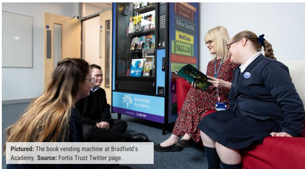
Pictured: The book vending machine at Bradfield's Academy.

Do you think that a book vending machine at school is a good idea?