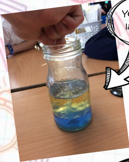
Year 5 and 6 lava lamps!

During the week, we have all had fun doing our own experiments, learning about coding, building and solving problems!