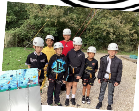
The Dinton Group

We even found time to fit in lessons this week! In Science, we learned how scientists classify living organisms before creating a Classification system for our favourite snacks.